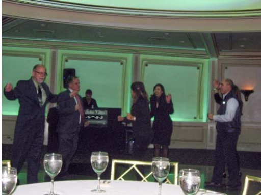
Revelers getting down to the beat.